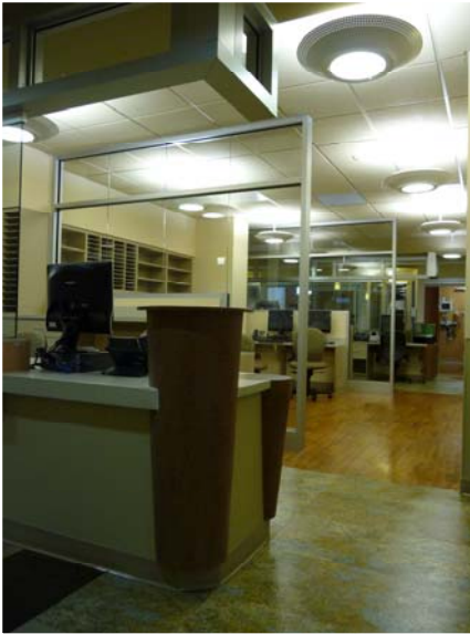
View through Nurse Charting Area